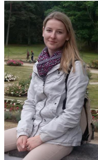
IWAMA project junior expert