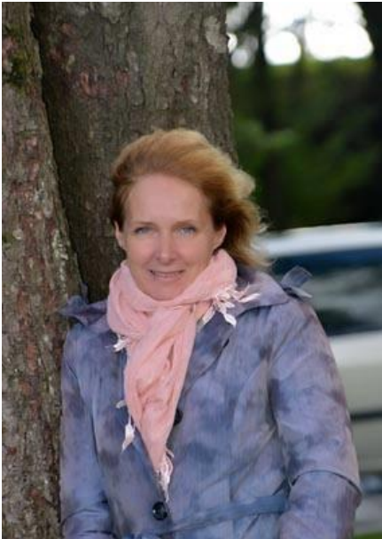
IWAMA project coordinator