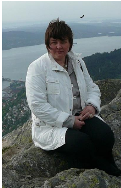
IWAMA project senior expert